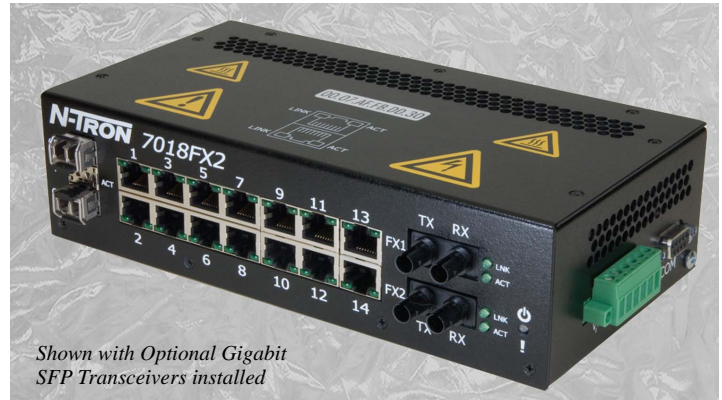
Shown with Optional Gigabit SFP Transceivers installed

DHCP -DHCP Server / Client automates the assignment of IP addresses. DHCP Option 82 assures that if a device on a specific port is replaced, the replacement receives the same IP address as the original device.